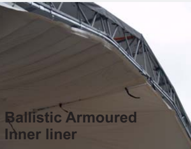
Ballistic Armoured Inner liner