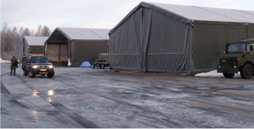
AIRFORCE RASS SHELTER 18,4 x 15,5 x 4,1 (5,7)

SHELTER HALF - NATO Approved product NSN 8340-58-000-0679